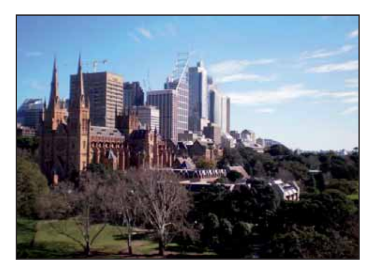
Views to St. Mary's Cathedral & Sydney Harbour Bridge